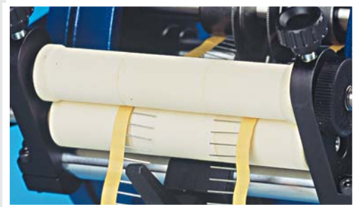
TNS TP6, TP6/97, TP6/PR-B, TP6/PR-B/97, TP6/V, TP6/S, TP6/R, (Cod.21.0011)

The TNS is an accessory that helps to pull the tape out of the back of the machine after the components have been cut and formed. This attachment mounts easily to any of the models designed for taped components. A TNS comes already assembled to the TP6/PR-F machine.