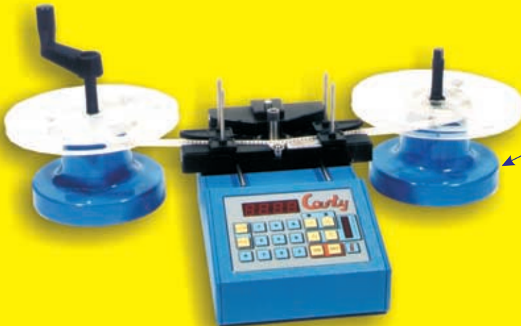
8301.028 SMD support for rolled bandolier